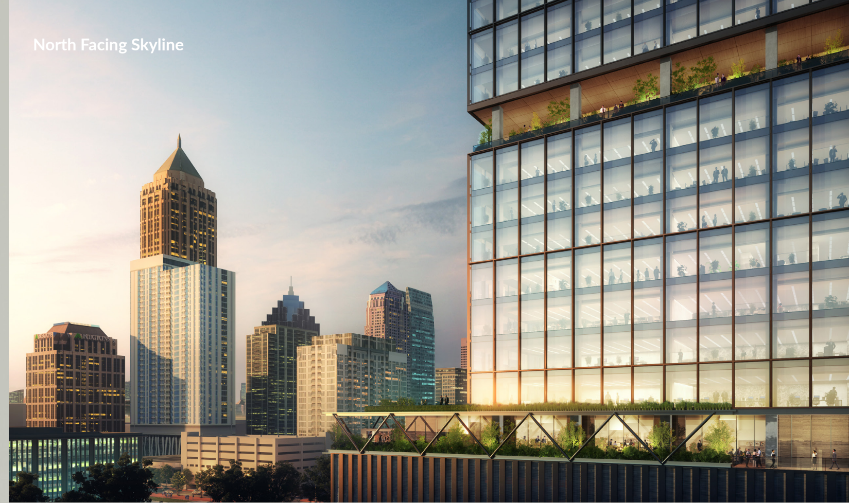
North Facing Skyline